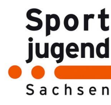
Steffen Richter Sport Youth Saxony