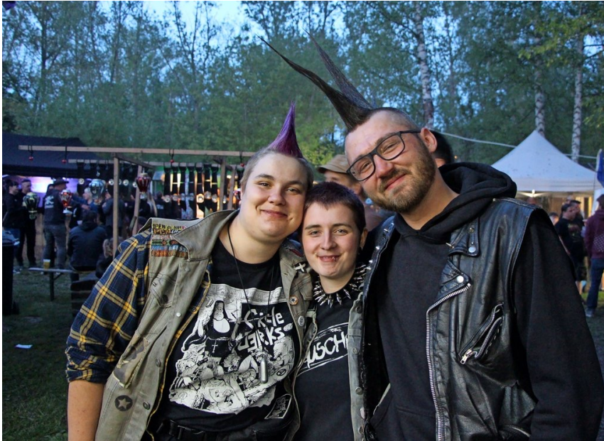
Punk festival, Deutzen, Saxony, 2022